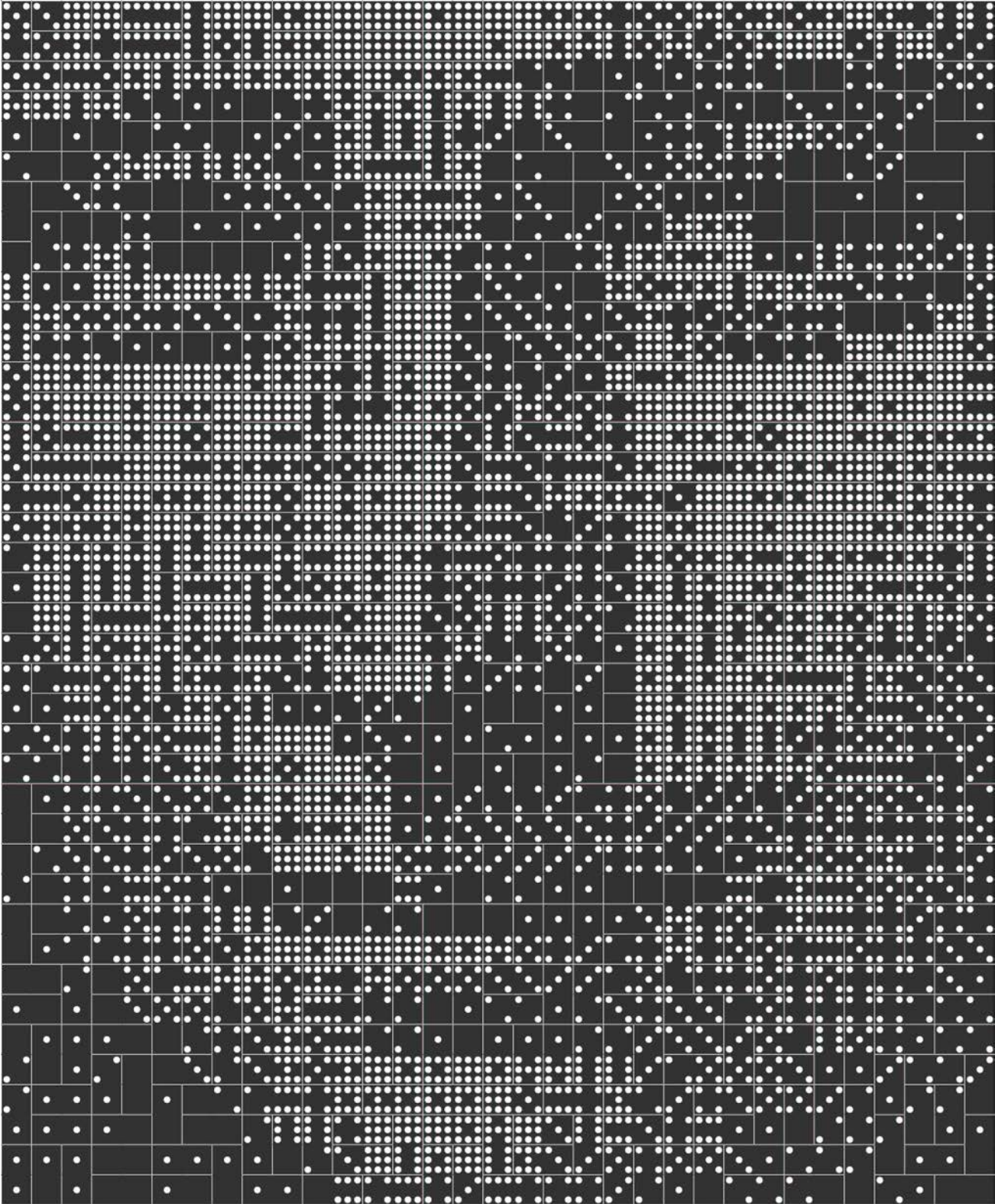
Figure 1: The Mona Lisa rendered in 12 complete sets of double nine dominoes